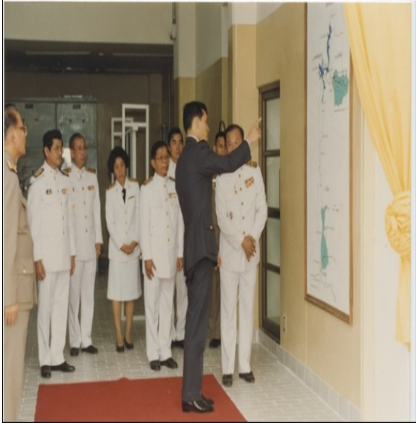
HRH Crown Prince Maha Vajiralongkorn proceeded to preside the opening ceremony of Huai Pra Tao Hydropower Plant Project at Kang Kraw District in Chaiyapoom on June 30 th , 1993