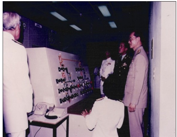
HM King Bhumibol and HRH Princess Maha Chakri Sirindhorn proceeded to preside the opening ceremony of Kiridhan Hydroelectric Project at Ma Kam District in Chantaburi on June 21, 1986.