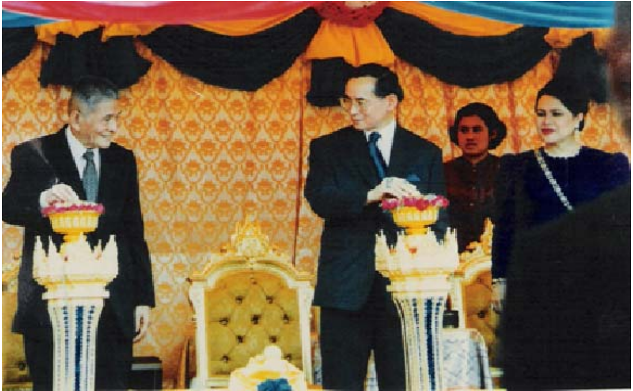
HM King Bhumibol Adulyadej and HE Noohug Poomsawan, Chair of Lao PRD proceeded to co-preside the opening ceremony of Thai-Lao Friendship Bridge in Nongkai on April 8 th , 1994.