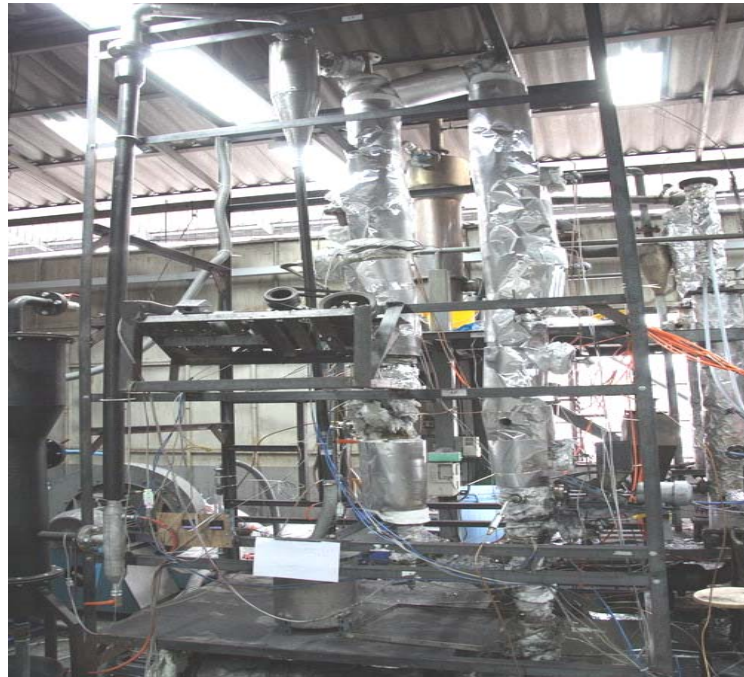
Figure 2: the Reactor Developed for Hydrogen Production System by Thermochemical Process

It is found from the Study and Testing of Hydrogen Production System developed that, this system has the potential in producing fuel gas with a hydrogen proportion at average higher than 40 percent (as shown in Figure 3). Thus, it is appropriated to make a pure hydrogen for further utilisations. The demonstration system of this hydrogen production developed by DEDE, the Department of Alternative Energy Development and Efficiency , can be counted as the first reactor of hydrogen production by thermochemical process in Thailand. It capably adopts various raw materials, likewise biomass, available in the country for utilisation. This will be benefit to promote and create the industry of hydrogen and fuel cells in Thailand in the future.